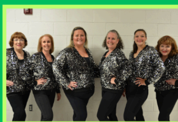
Adult Tap Tuesday 7-8 PM