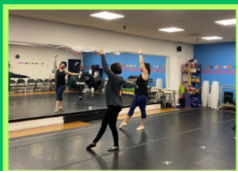
Adult Ballet Monday 7:30-8:30 PM