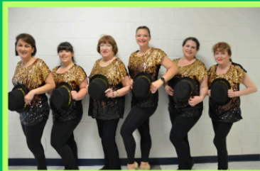
Adult Tap/Jazz Thursday 7-8 PM