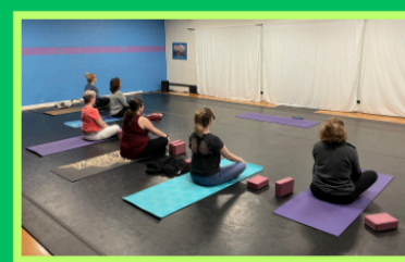
Adult Gentle Yoga Saturday 9:30-10:30AM